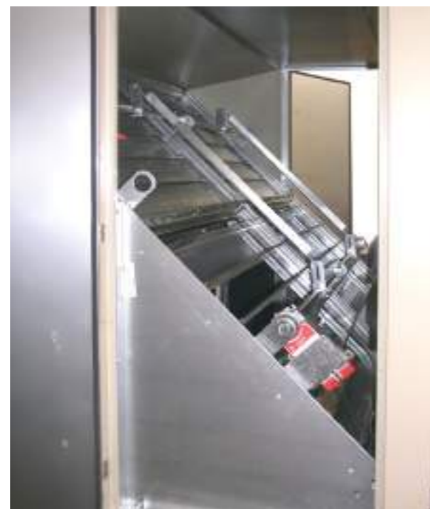
Standard low-leak dampers for superior resistance to air leakage and reduced energy costs.

Stainless steel, double-sloped drain pans per ASHRAE Standard 62.1-2004 for good indoor air quality.