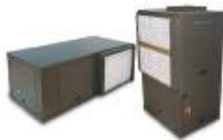
SmartSource™ High Efficiency Water Source Heat Pumps