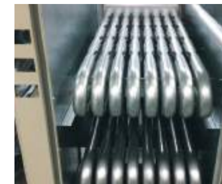
Gas Furnace Tubes