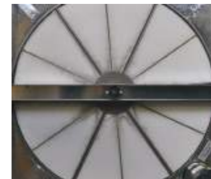
Energy Recovery Wheel