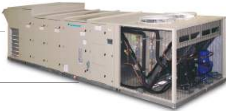
Maverick™ II Commercial Rooftop Systems 15 to 75 tons