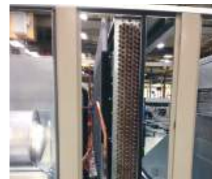
Modulating Hot Gas Reheat

Maverick II rooftop systems are ideal for 100% dedicated outdoor air systems (DOAS). Units can be equipped with modulating hot gas reheat to increase occupant comfort and avoid over-cooling and units can incorporate an optional energy recovery wheel that can drastically improve operational costs. Also available is a 100° temperature-rise furnace for unit operation in cold-weather climates.