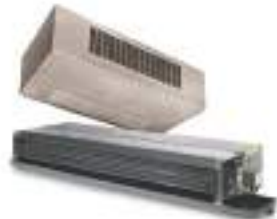
Fan Coil Units