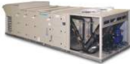
Maverick™ II Commercial Rooftop Systems 15 to 75 tons