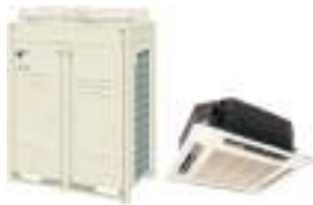
Daikin VRVs with Cassettes